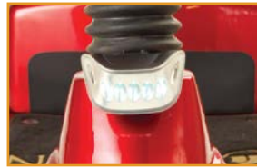
Angle adjustable LED headlight creates a wide path of bright light