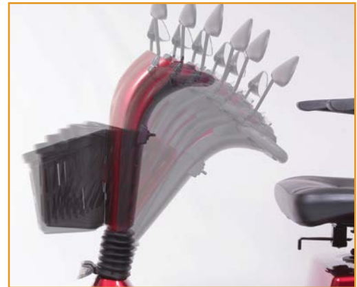
Patented infinite adjustable tiller