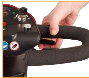
EZ Reach tiller adjustment