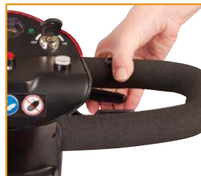
EZ Reach tiller adjustment