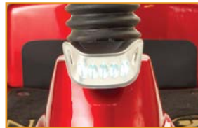
Angle adjustable LED headlight creates a wide path of bright light