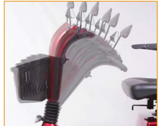
Patented infinite adjustable tiller