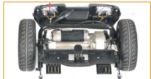
Quiet & maintenance free motor