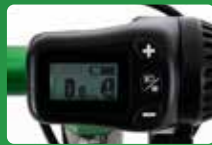
Digital LCD display