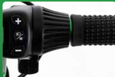
Twist grip throttle