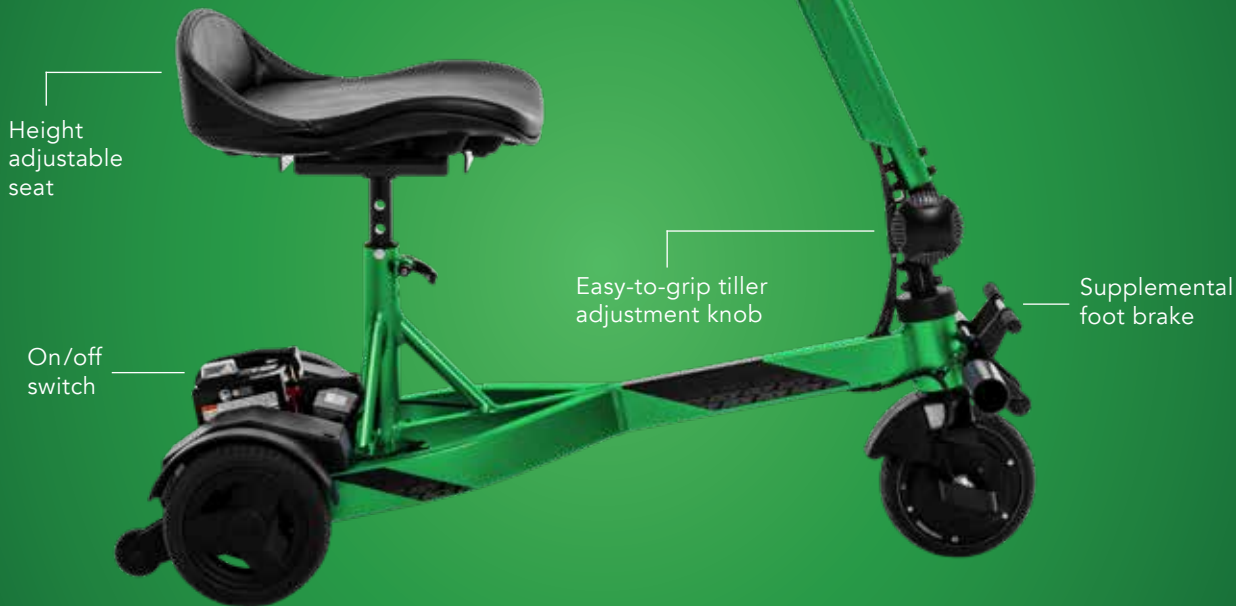
Height adjustable seat