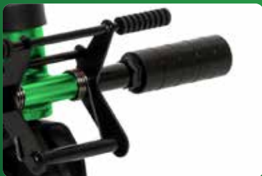
Supplemental foot brake