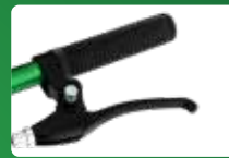
Manual hand brake