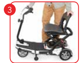
Unfold Seat; Lock in Place