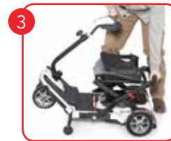
Fold and Lock Tiller