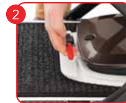
Pull Up Lever to Fold