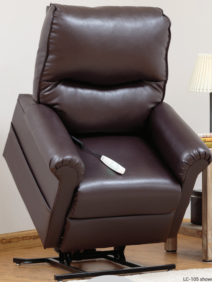
LC-105 shown in Lexis Urethane® New Chestnut

Protect your investment with the Pride® Power Lift Recliner Care Kit