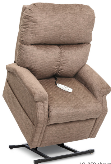
LC-250 shown in Cloud 9 Stone