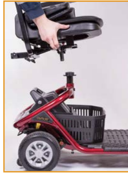
Pick up the seat