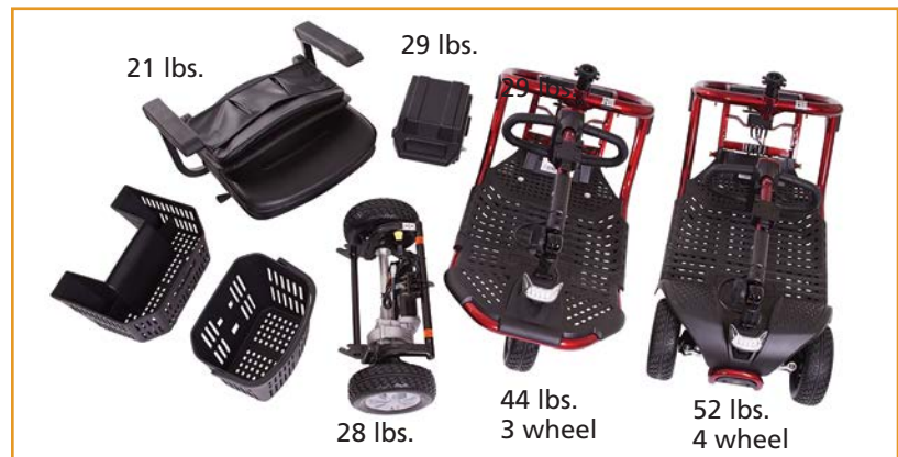
Disassembles into six pieces for transport and storage! No wires to connect or disconnect!