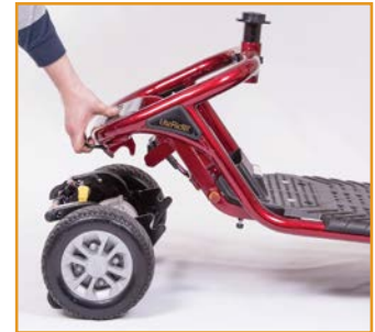
While squeezing the release lever, pull up on the rear frame