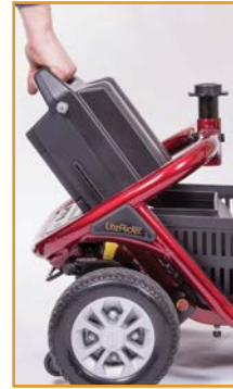
Pull out the battery pack