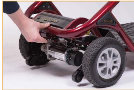
To separate the rear transaxle from the frame, squeeze the release lever located on the underside of the frame