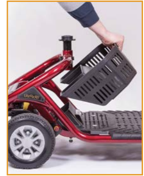
Remove the baskets from under the seat and from the tiller (not shown)