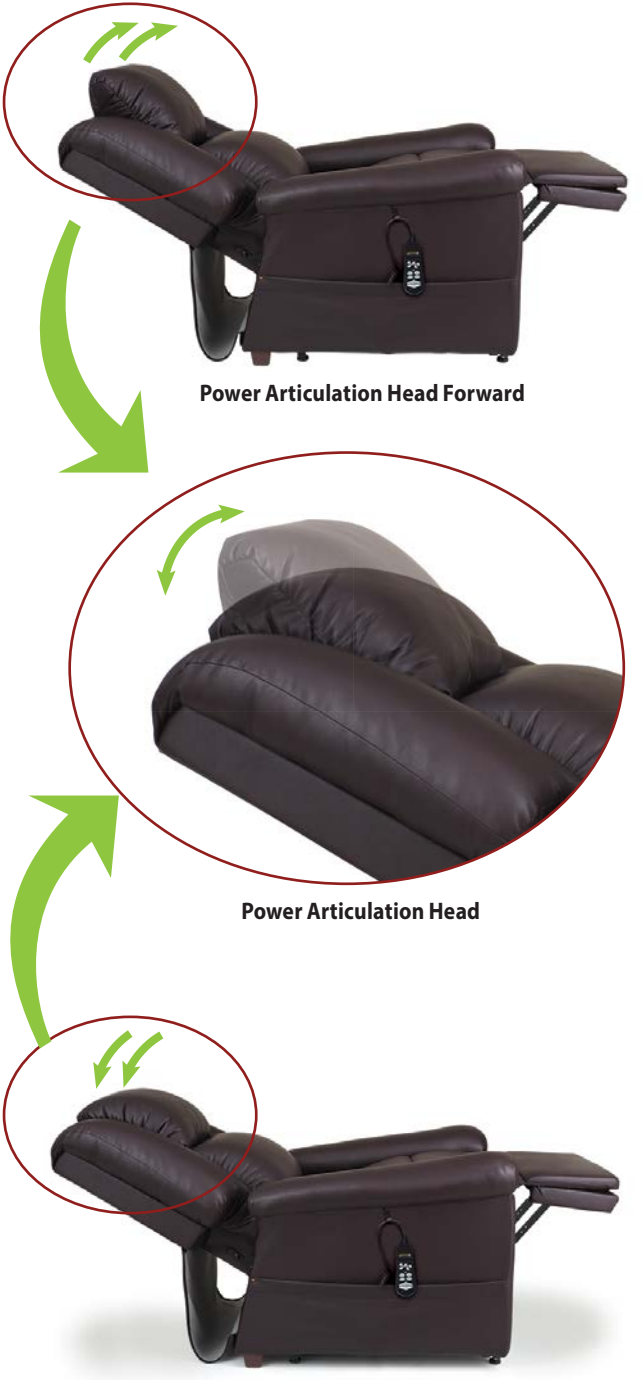
Power Articulation Head Back

Sizes may vary depending on fabric, filling material, upholstery and carpet thickness. All measurements taken on concrete floor using levels and metal rulers.